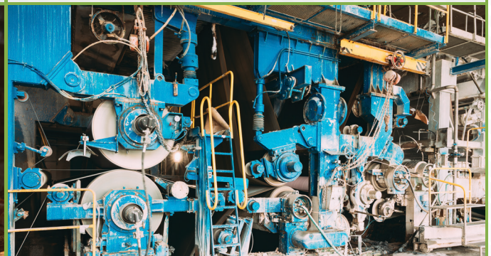
PAPER AND PULP